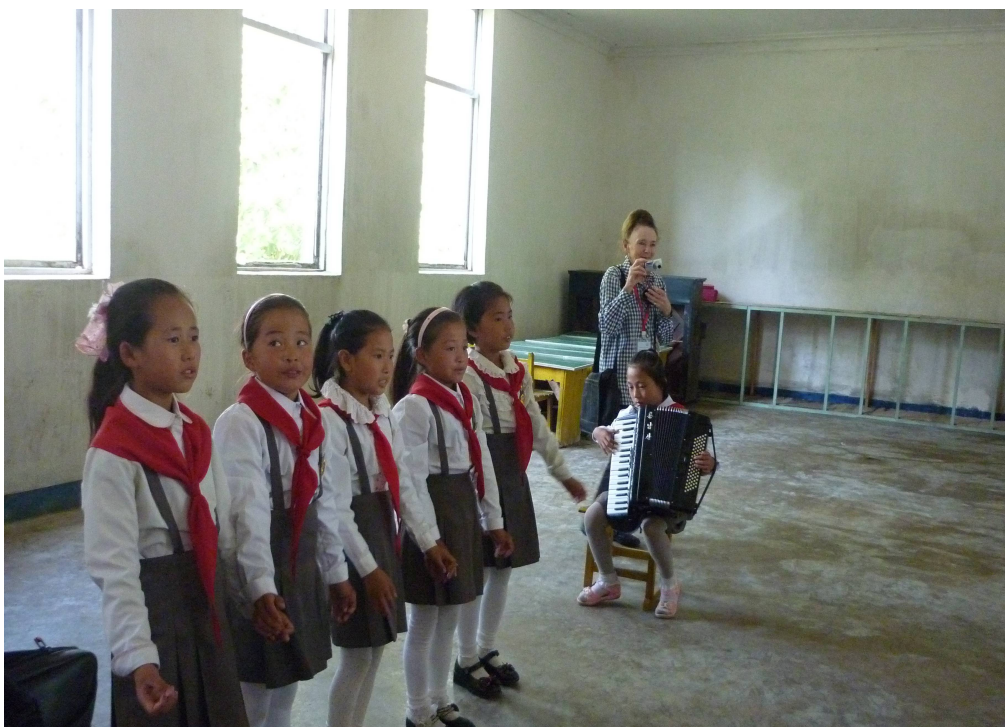
Dance class in rural Korean school.