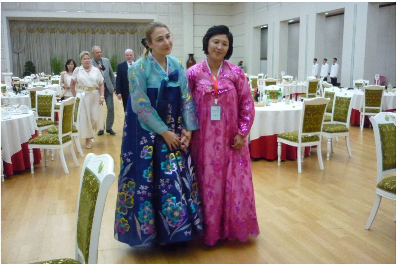
Traditional Korean dress