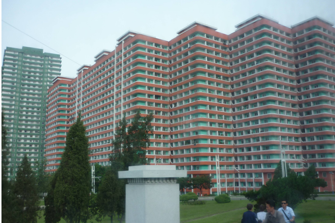
Korean apartments, Pyongyang.