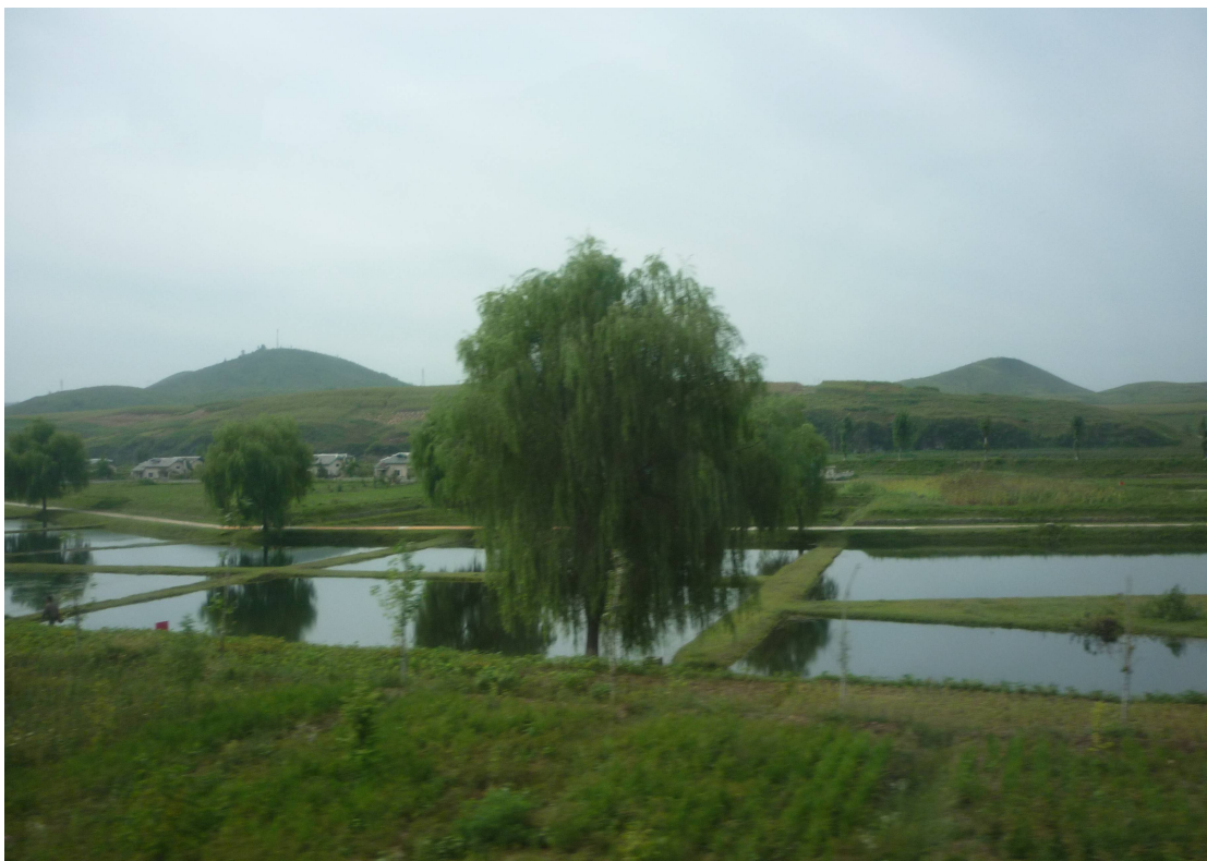
Rural Korea - fish farm.