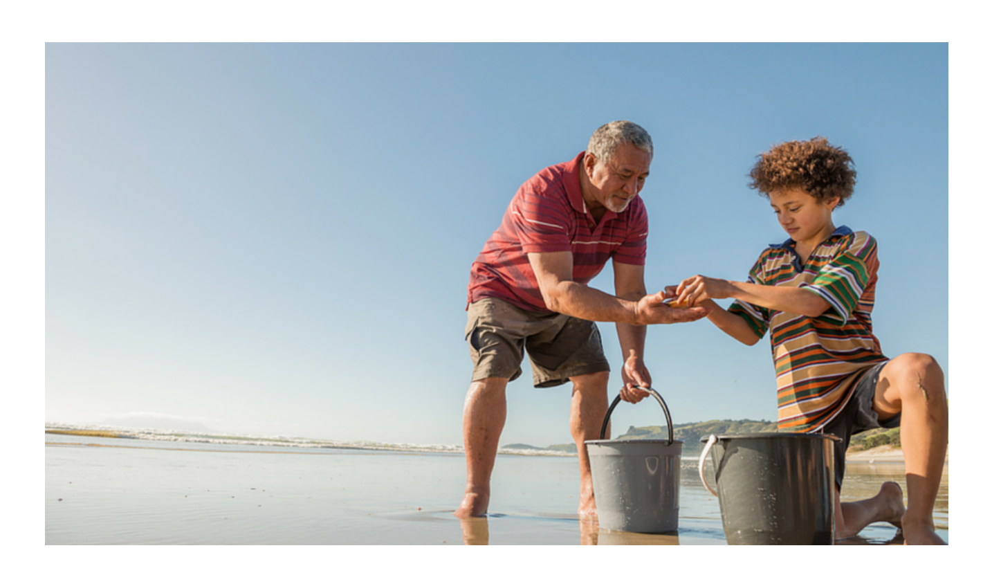
Naku te rourou nau te rourou ka ora ai te iwi With your basket and my basket the people will live

We exchange a sign of peace with one another.