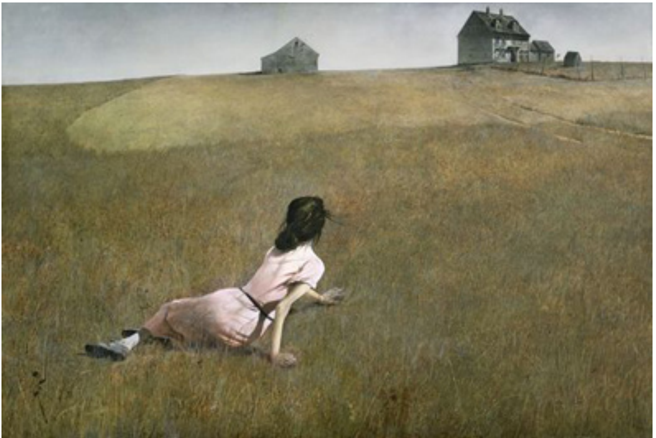
"Christina's World" - Andrew Wyeth, Maine, USA, 1948

CALLED TO STAND TALL AMONG WHEAT, WEEDS AND THE PATIENCE OF GOD