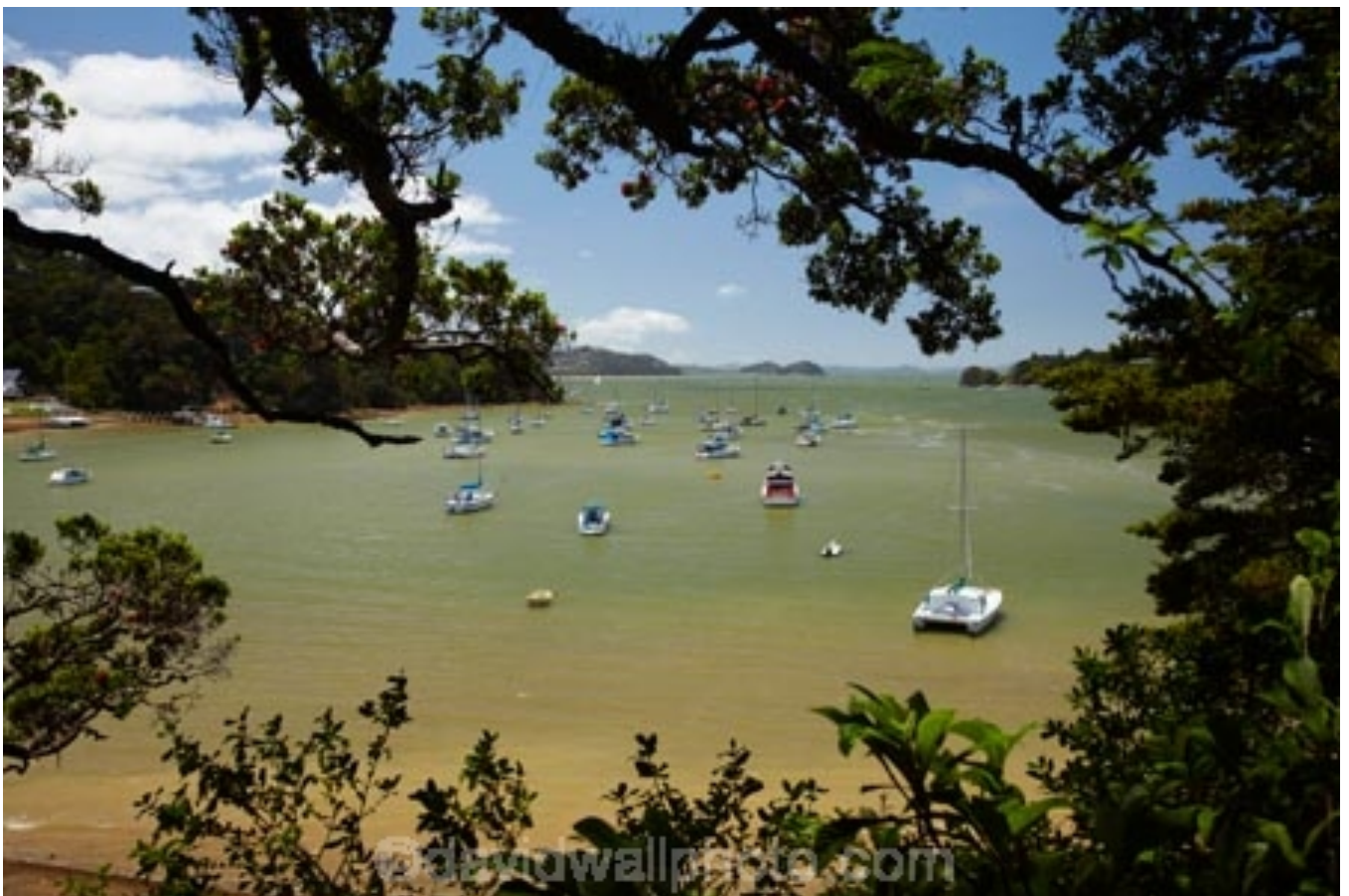
Boats moored off Opua, Bay of Islands