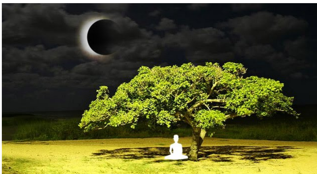
Under a fig tree