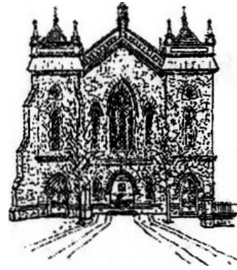
Durham Street Methodist Church