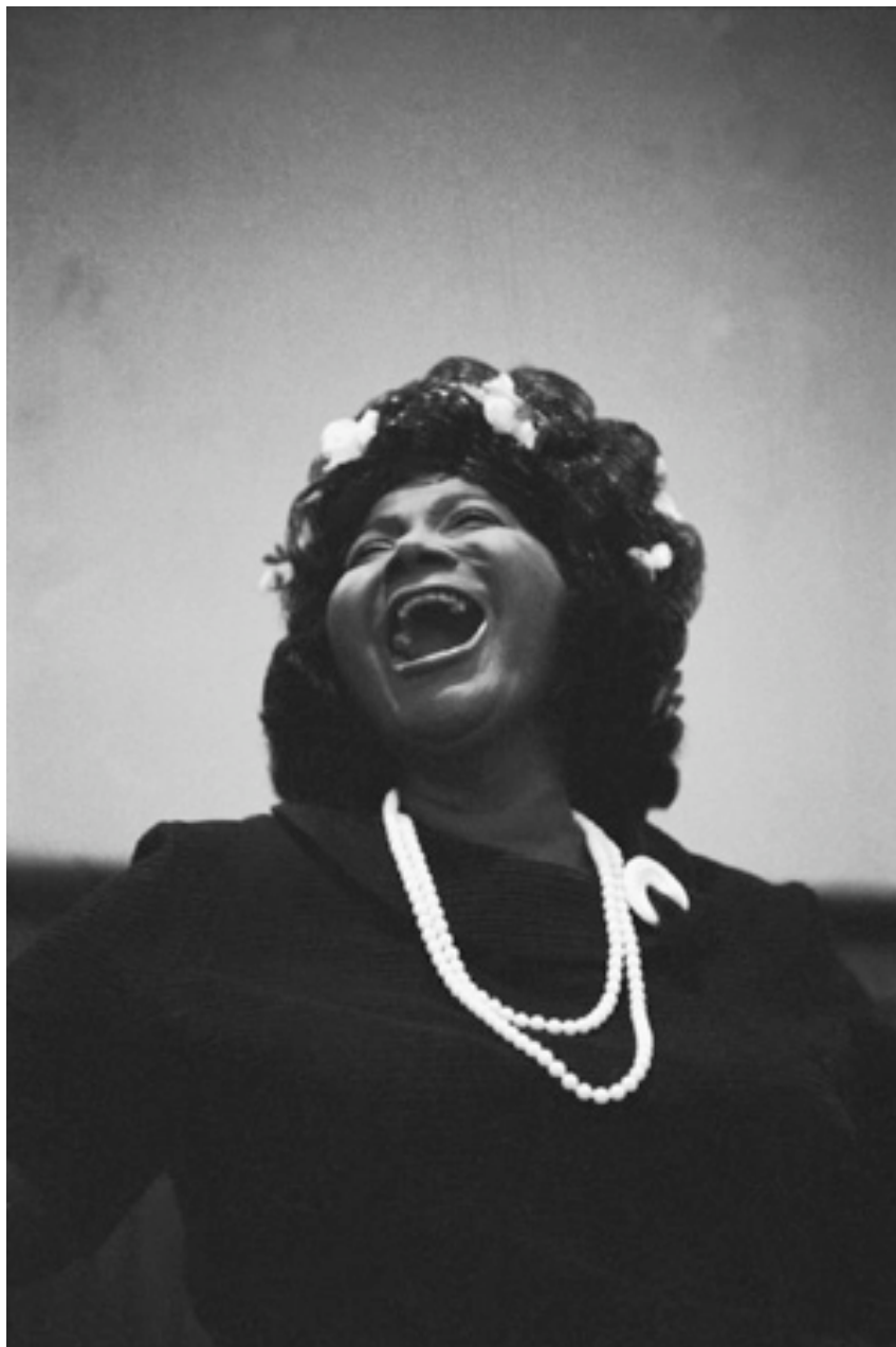
My strength and my song