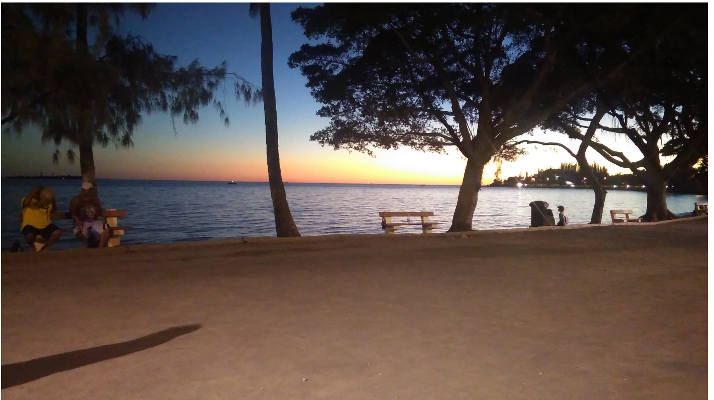
Sunset at Anse Vata, New Caledonia