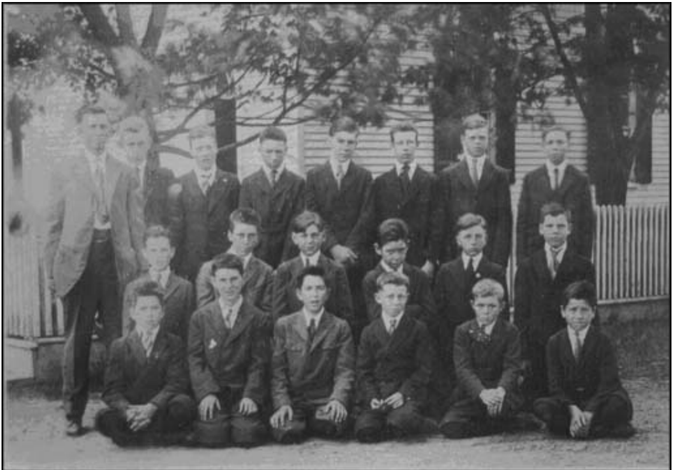
The boys of Walnut Springs Church, Virginia, enjoying Sabbath School, c. 1920

Music printed in this order of service is covered under a music copyright licence agreement: LicenSing #604802