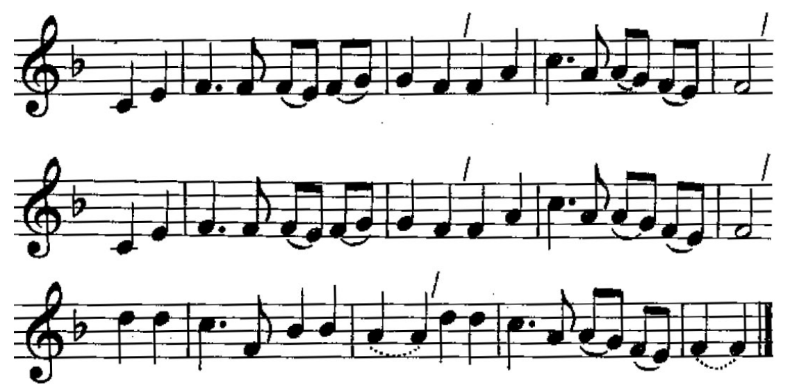
Verse 1 is sung by a soloist. Verse 2 is sung by the Knox Singers only. The congregation starts singing at verse 3.