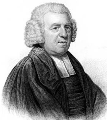
John Newton (1725-1907)

composed the famous conversion hymn, Amazing Grace