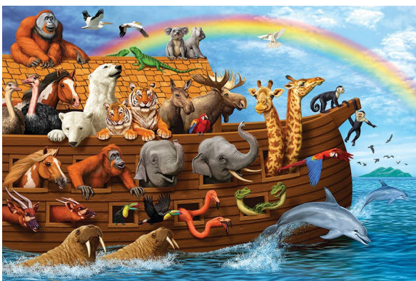
One of many pictures of Noah's ark