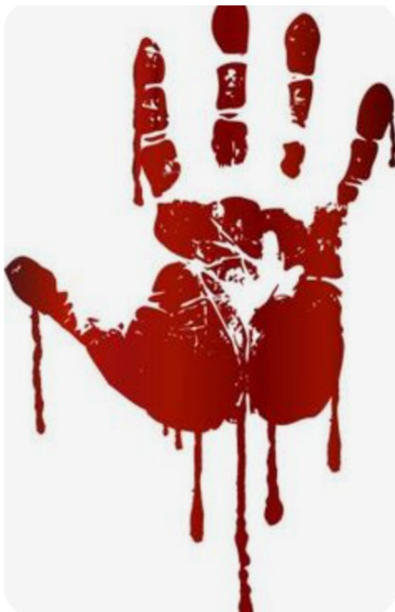
officials wash their hands