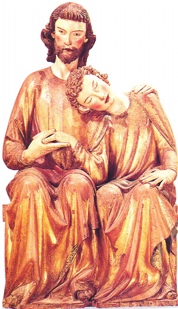
Peter spoke up and said to Jesus, "I will never leave you, even though all the rest do!" (Matthew 26:33)