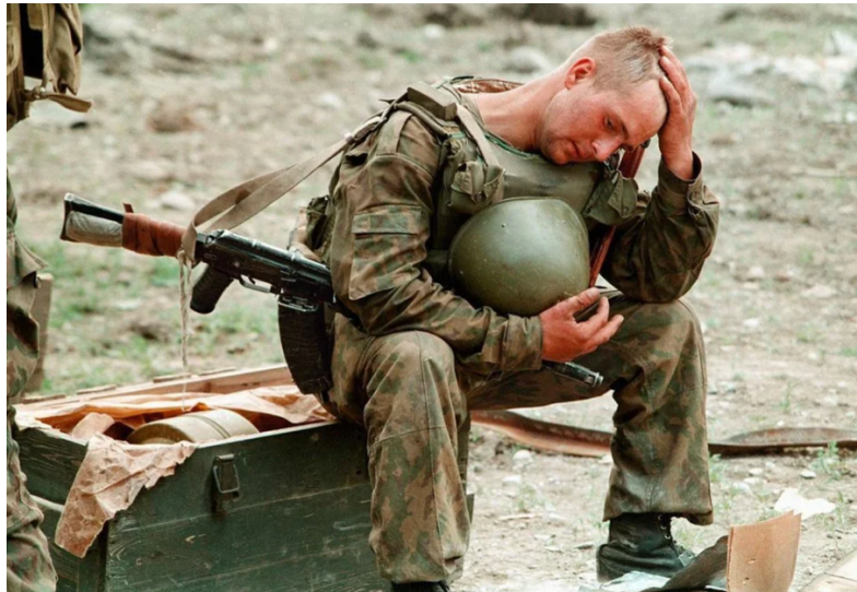
The dice didn't help