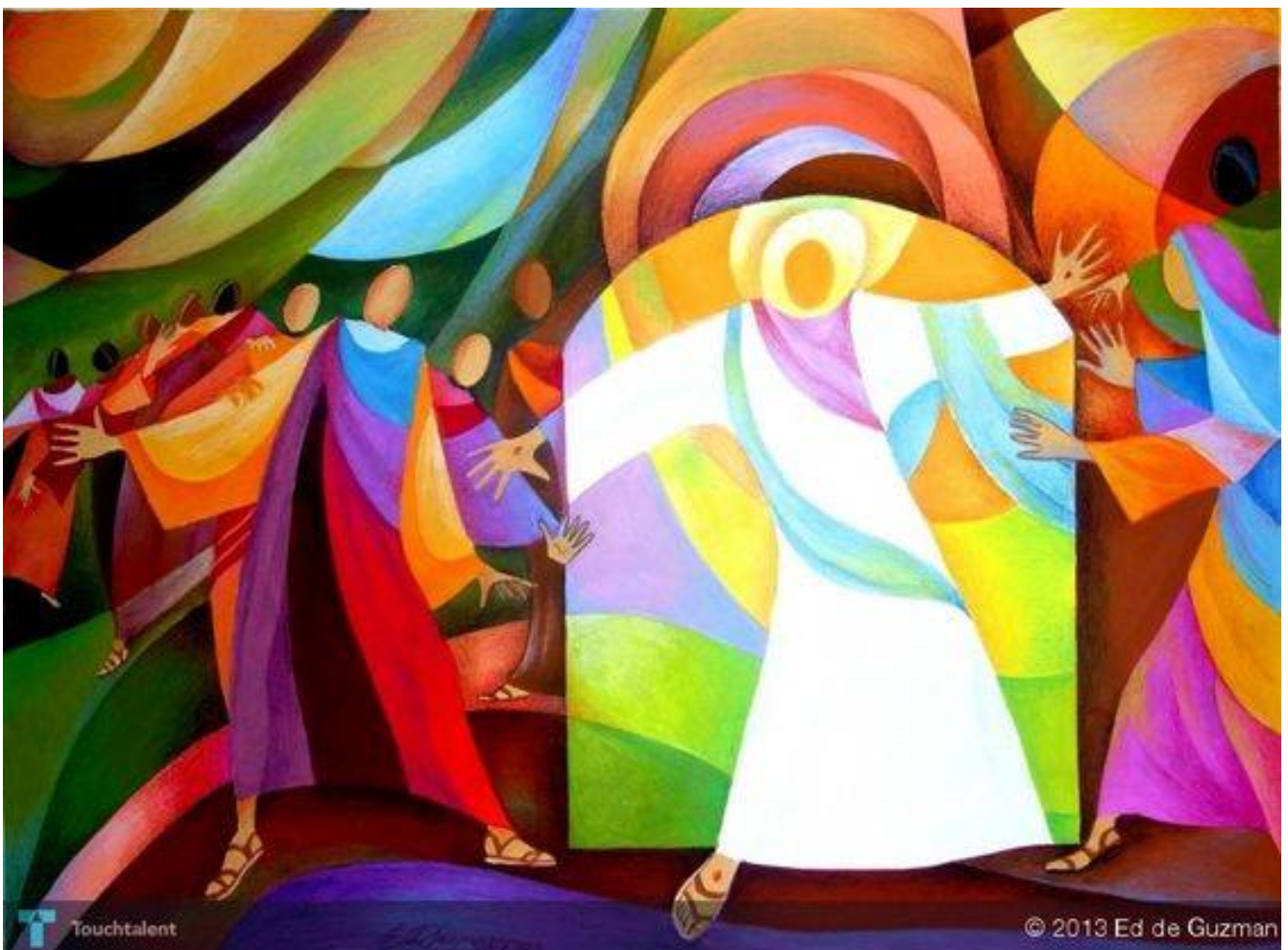
With a more modern resurrection artwork, Ed de Guzman, 2013

Music printed in this order of service is covered under a music copyright licence agreement: Licensing #604802