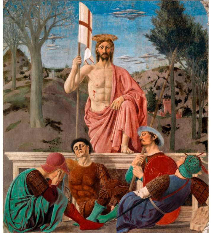
Piero della Francesca (1465)