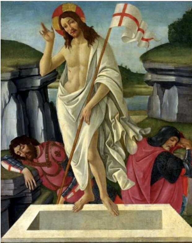
Sandro Botticelli (1490)